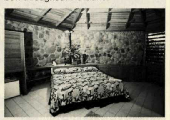
Above: The bures at Dive Taveuni are spacious, airy and brightly lit. Below: The Lelewai II transports divers to Fiji's magical reefs.

When your day's dives are memories, what else is there to see and do on this island? The third largest island in Fiji, Taveuni is nicknamed the Garden Isle because of its wet climate. The advantage to lots of water is beautiful foliage; you can find flowers of every color of the rainbow throughout the island.